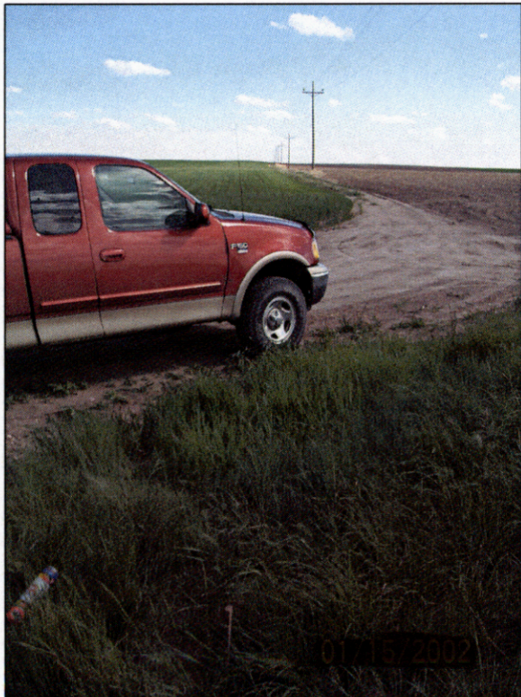
FOUND REBAR View South