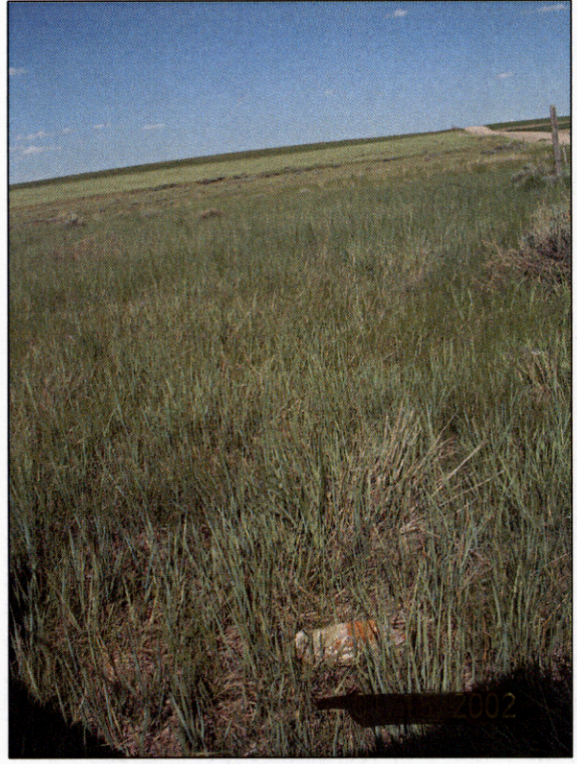
FOUND STONE View East