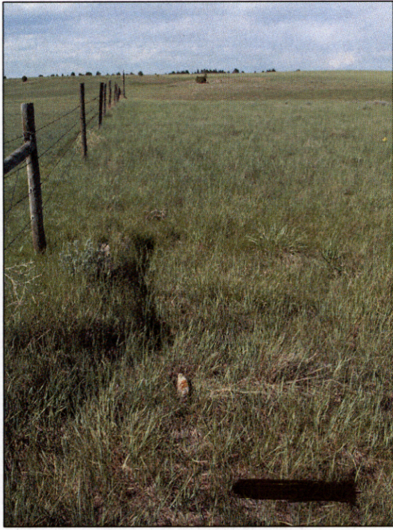
FOUND STONE View North