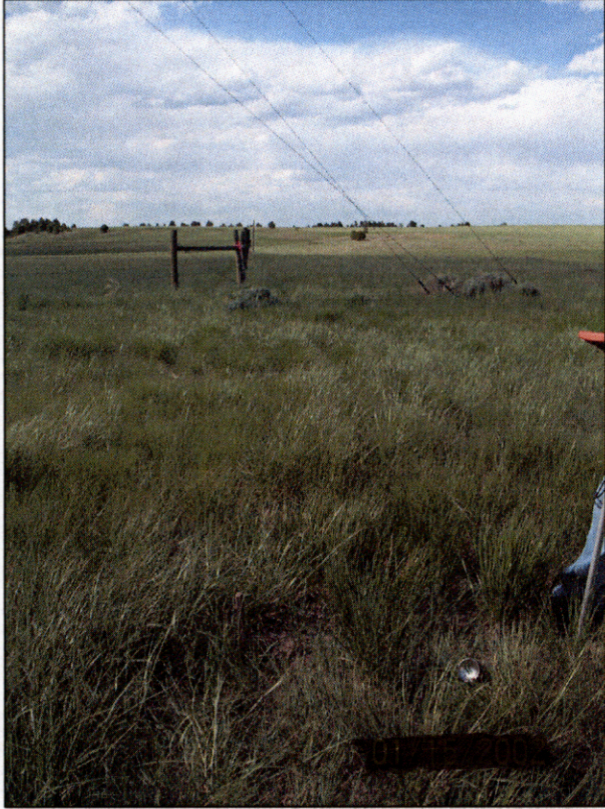
FOUND REBAR View North