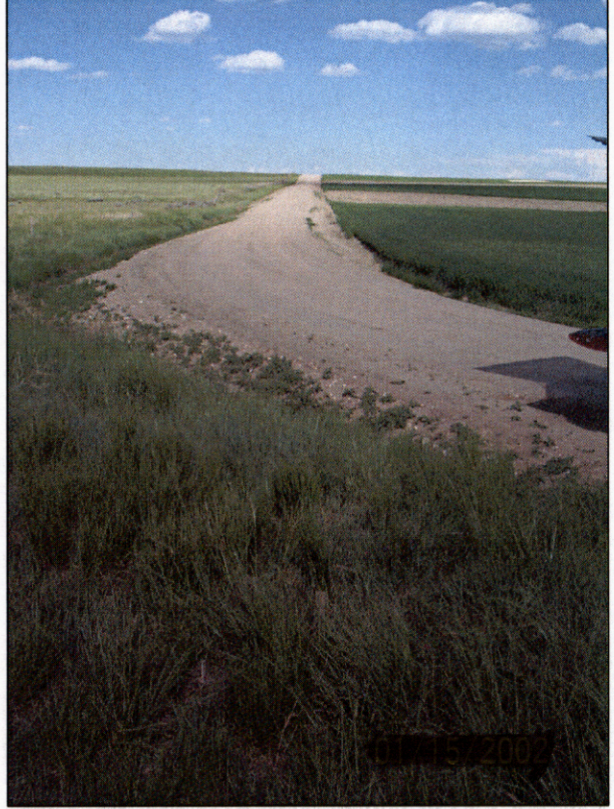
FOUND REBAR View East