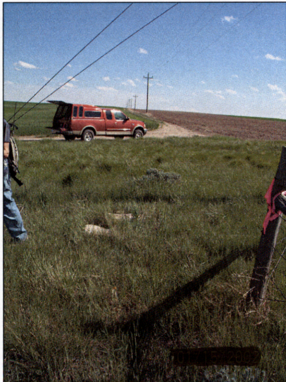
View South FOUND STONE