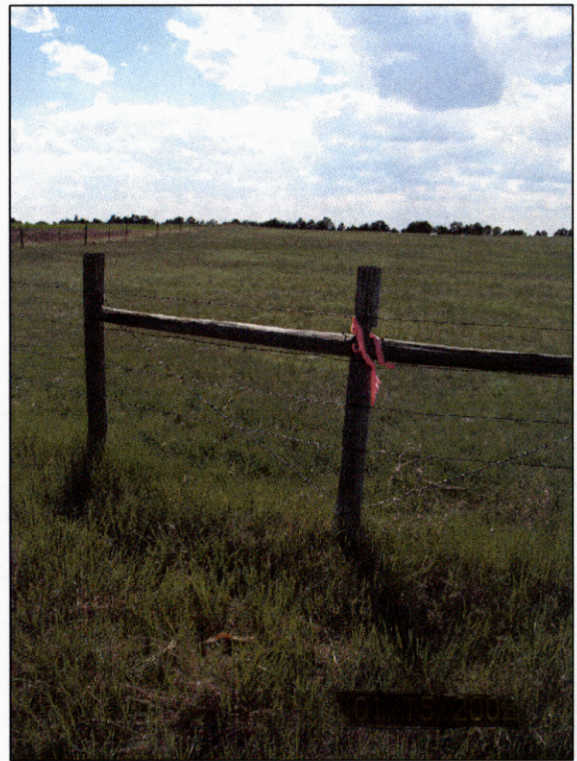
View West FOUND STONE

Corner Name NW Section 27 , T 13 N, R 60 W, 6TH P.M.